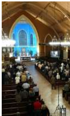
St. Paul's Church