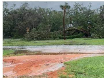
Fallen Trees after Hurricane Sally