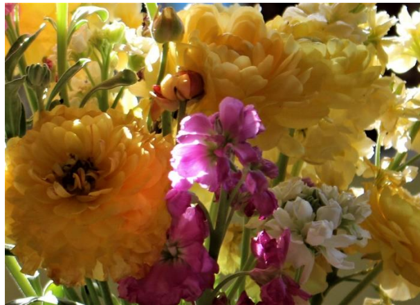
Peony Bouquet

Open Mic on Zoom, Third Tuesday, May 18 at 6:30 p.m.